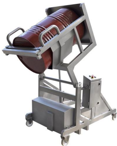
30.0103.08 – for barrels and drums