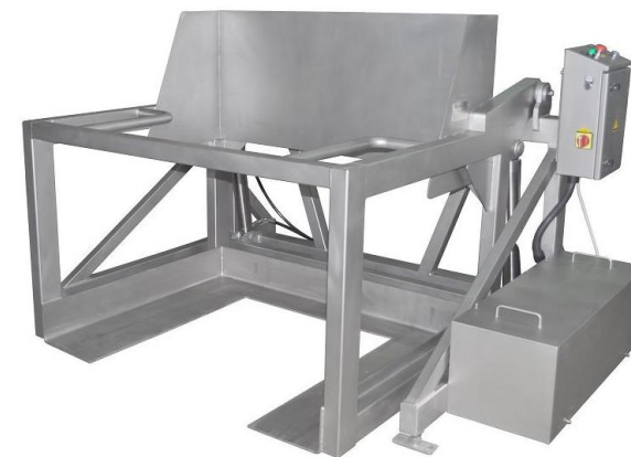
30.1009.05 – for containers