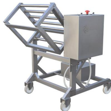
30.5101.01 – with storage battery for vessels