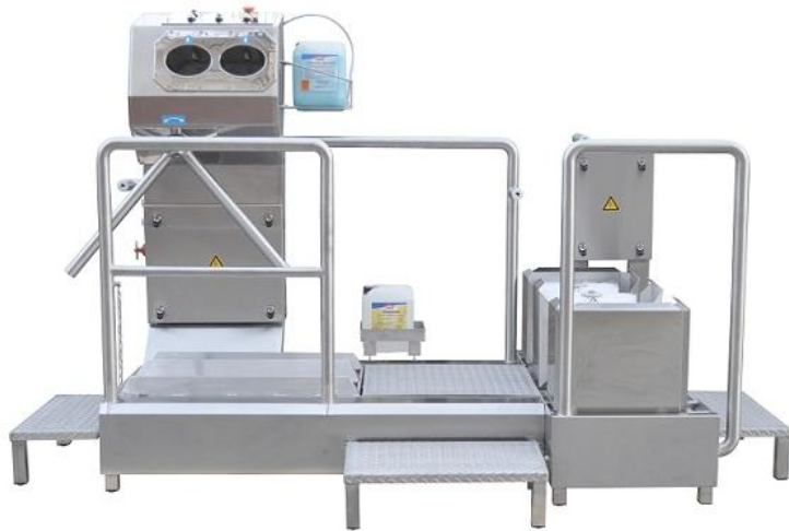
10.4031.00 – with boot cleaning