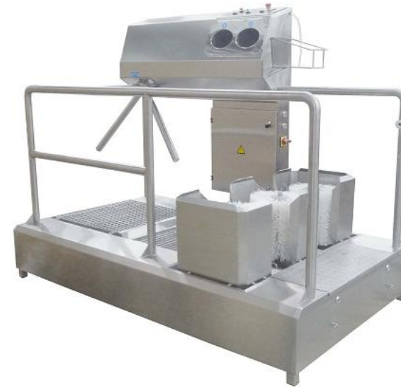
10.4221.55 – with disinfection bath