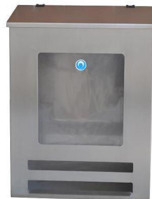
62.4043.00 – hats dispenser