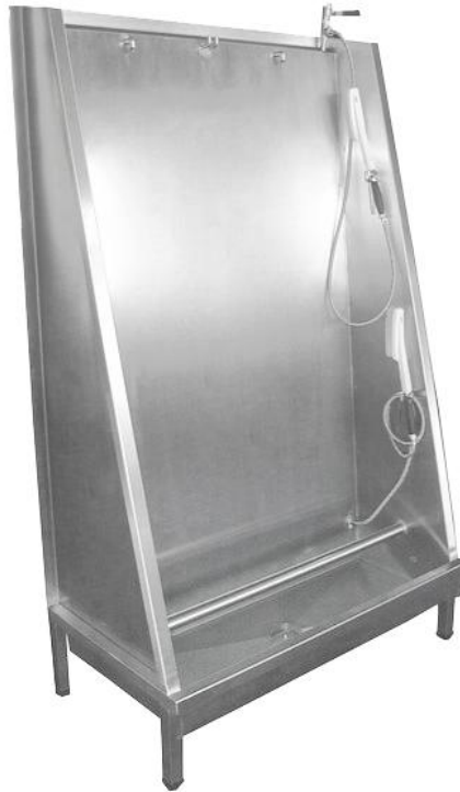
12.8310.00 – place for aprons and boots cleaning