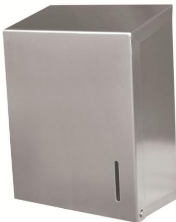
62.4042.00 – towel dispenser