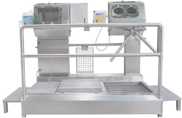
10.4212.00 – with towel dispenser and waste basket