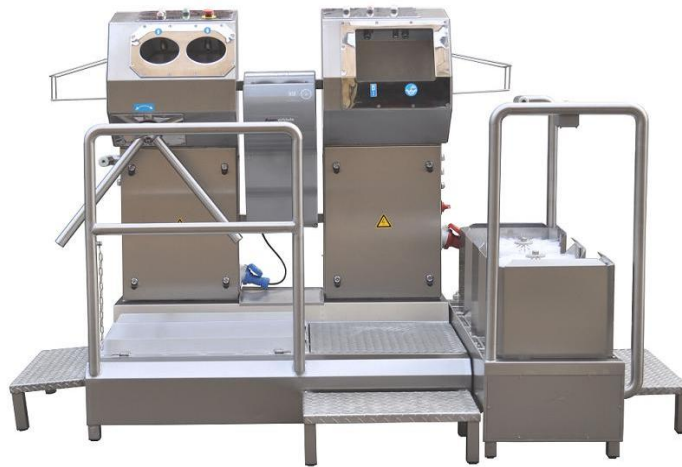
10.4033.03 – sink, hands dryer, independant module for boot cleaning