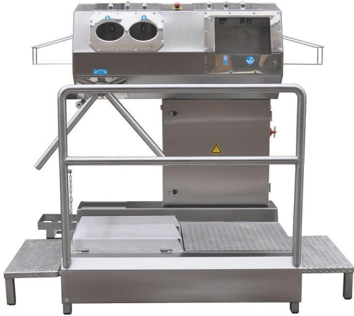
10.4013.50 – with 500 mm brushes