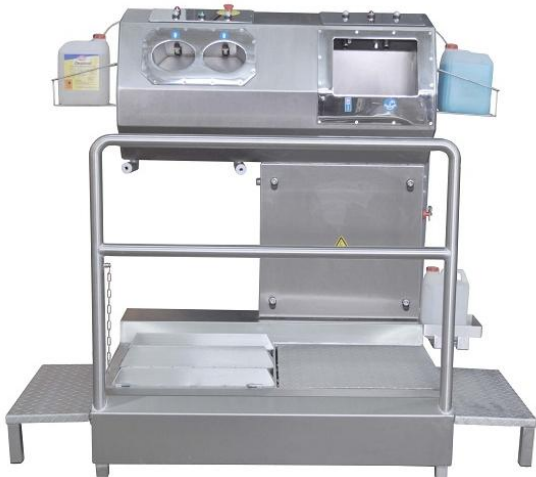
10.4013.55 – without turn style