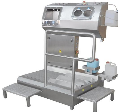
10.4012.51 - without turn style, step opposite of the sink