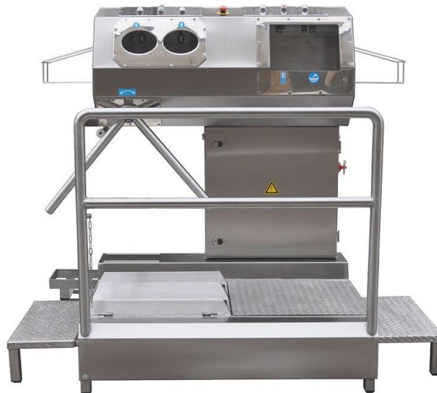
10.4013.50 – brushes 500 mm